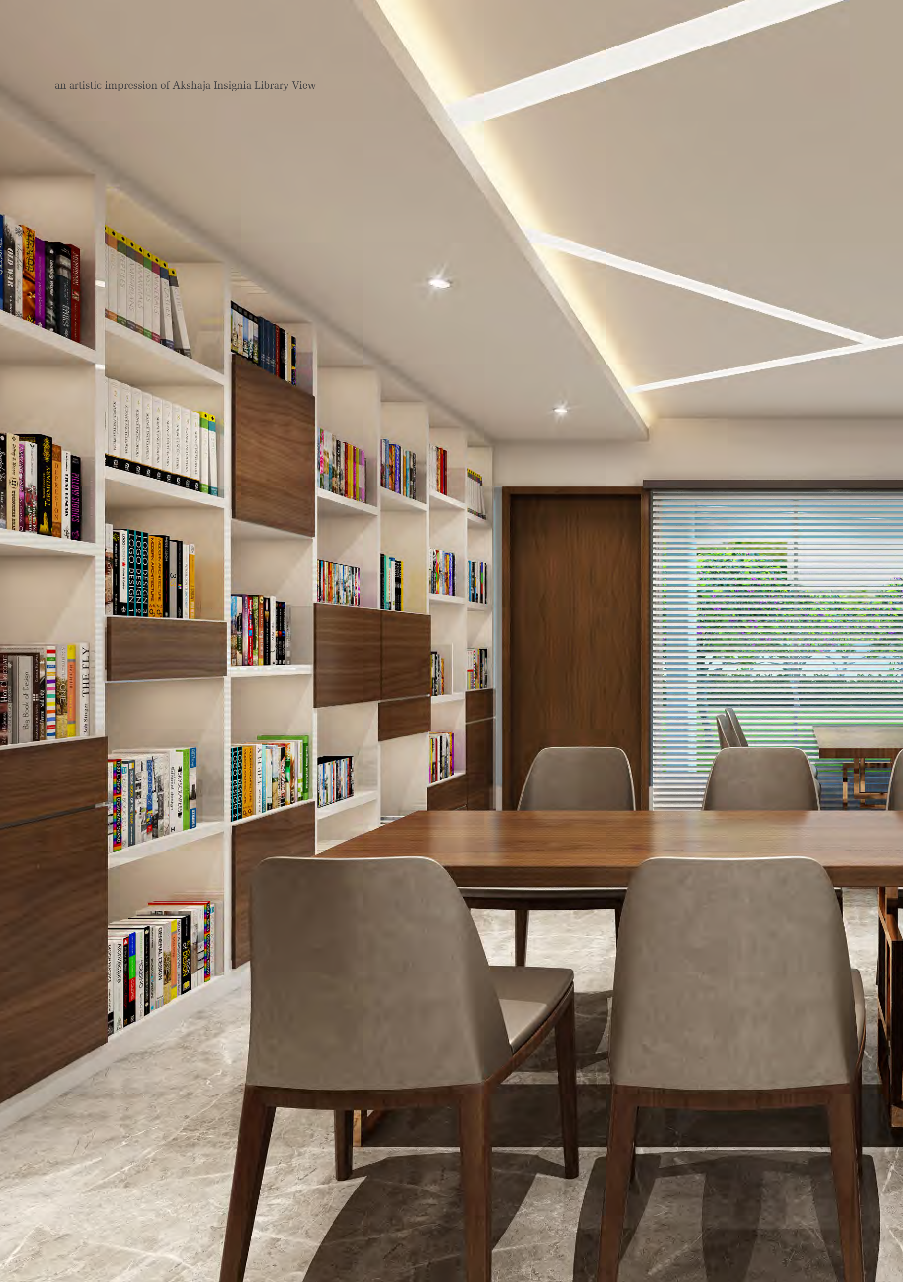
an artistic impression of Akshaja Insignia Library View