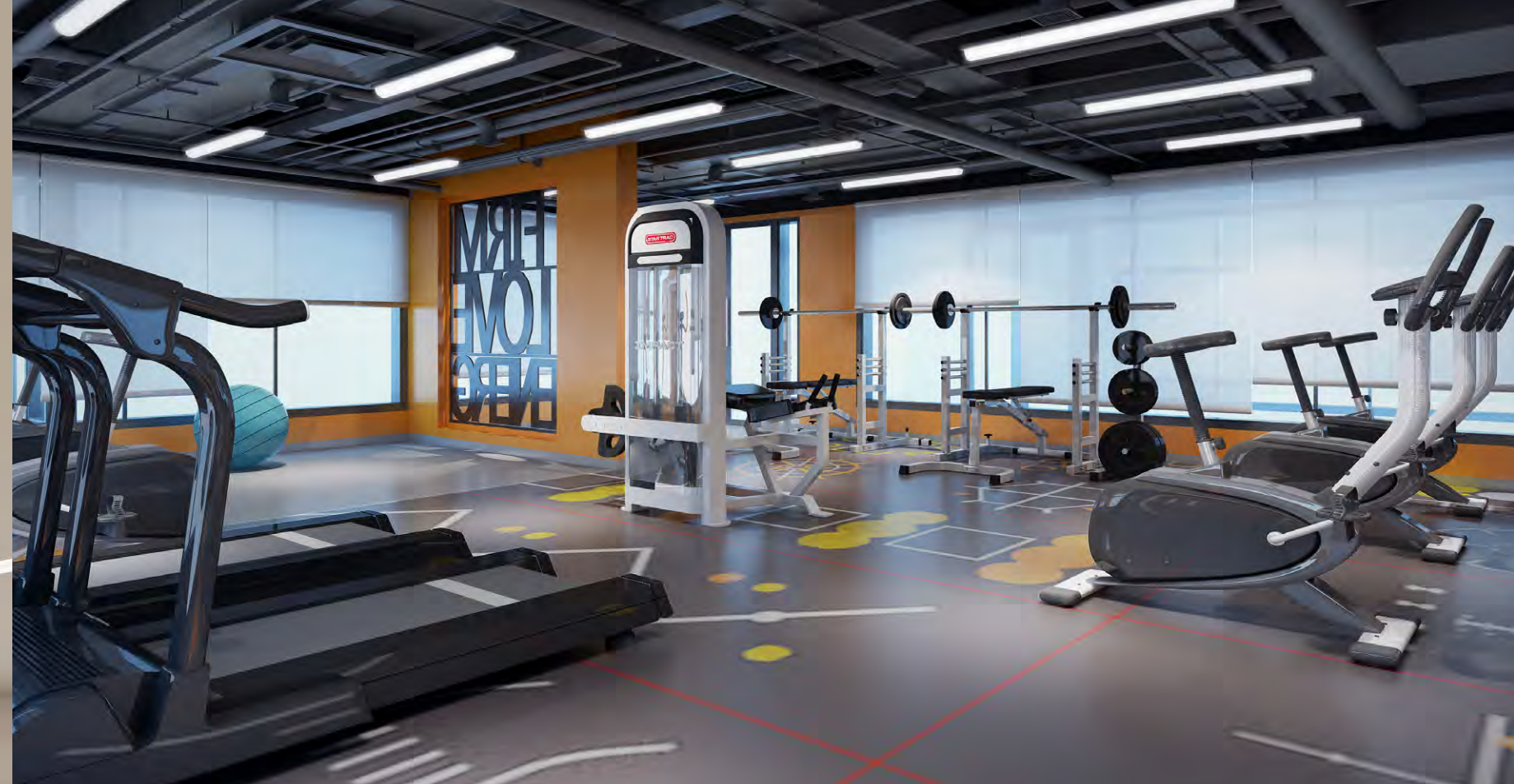
an artistic impression of Akshaja Insignia GYM View