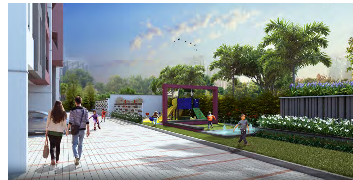
an artistic impression of Akshaja Insignia Rear Side View