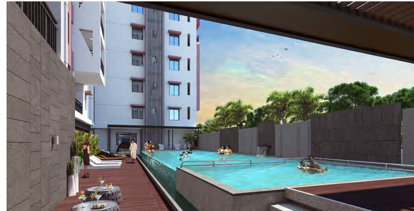
an artistic impression of Akshaja Insignia Pool View.