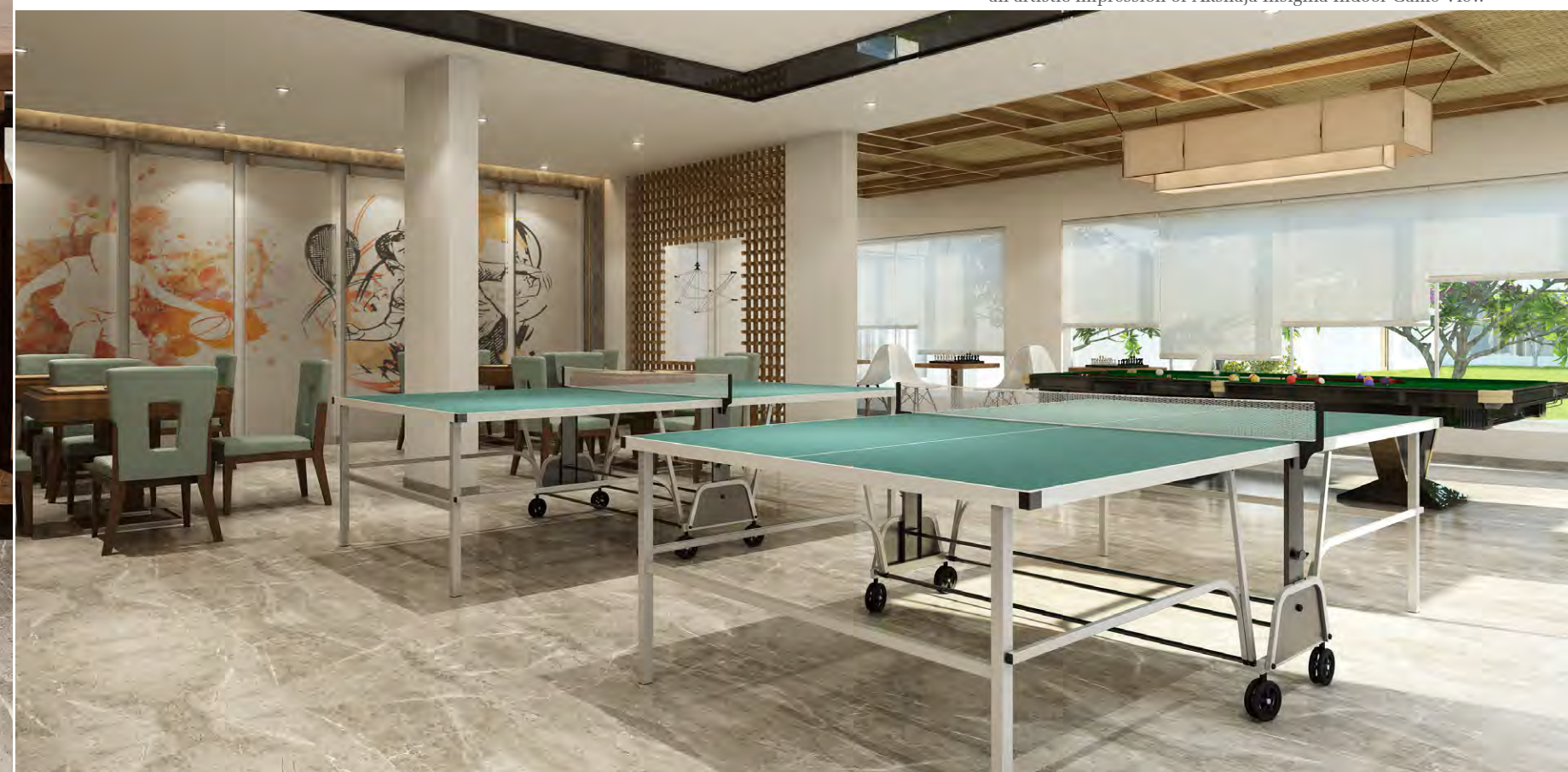
an artistic impression of Akshaja Insignia Indoor Game View